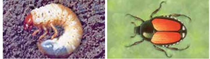
White grub larva