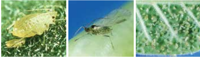
Adult aphid and nymph