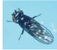
Shore fly adult