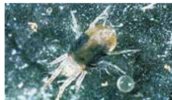
Spider mite adult female and egg