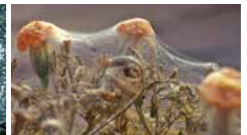
Webbing produced by heavy spider mite infestation

Spider mites have puncturing-sucking mouthparts. Feeding damage appears as light-colored spots, or stipples on upper leaf surfaces.