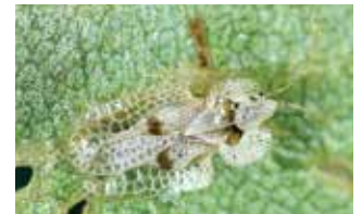
Lace bug adult

Lace bugs are sucking insects that feed on plant fluids. Feeding injury causes yellow spotting on leaves, which may turn brown and become small holes on the leaves.