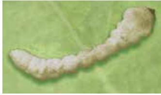
Flatheaded borer larva

Flatheaded borer (Buprestidae) adults are usually bright colored metallic beetles just under 1 inch long. Larvae do not have legs and have obviously enlarged segment toward the head (the flat-head look). Roundheaded borer (Cerambycidae) adults are fairly large, from 0.5 to 2 inches and have very long antennae – often longer than the body.