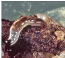
Fungus gnat larvae