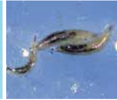
Shore fly larvae