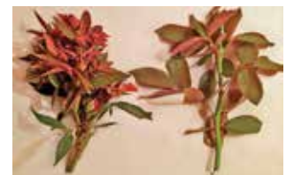
Rose rosette symptoms

Mites may overwinter on plants under bud scales and emerge when new buds start breaking in the spring. Under favorable conditions mites reproduce continuously and several 2-3 week long generations may occur in a growing season. Mites may be introduced into the greenhouse and nursery crops with propagation materials from infested areas. Control involves quick detection of symptoms and sanitation. Several miticides are registered for Eriophyid mite control. When needed treatment should be made preventively during bud break to avoid or minimize damage and disease transmission risk.