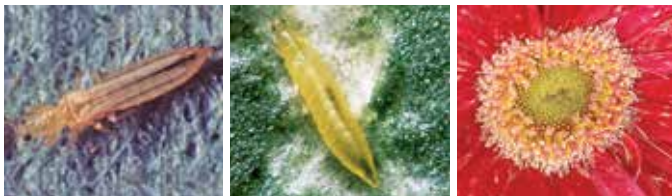
Adult western flower thrips