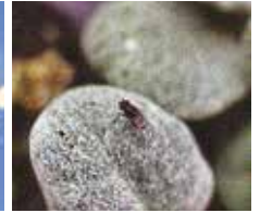
Shore fly adult and black fecal spots on leaf

Shore fly adults are small flies that resemble fruit flies in shape, but are smaller and have black bodies with red eyes. When at rest white spots can be seen on the wings. Both adults and larvae feed on algae, bacteria and protozoa. Direct feeding injury to plants is rare, but adults may help spread plant pathogens.