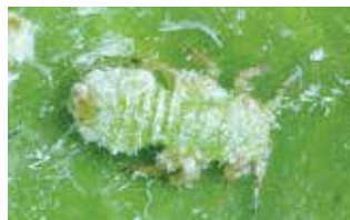
Boxwood psyllid nymph

The boxwood psyllid, Cacopsylla busi (Linnaeus) occurs wherever boxwoods are grown, but are more common in temperate climate regions. Both adults and nymphs feed by sucking plant sap causing terminals to become cupped and reducing twig growth. Feeding by nymphs causes more damage than adult feeding.