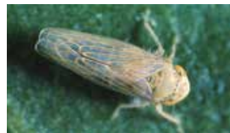
Rose leafhopper adult