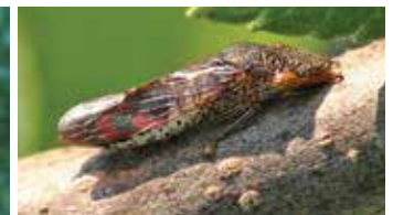
Glassywinged sharpshooter adult

Some of the most important leafhopper and sharpshooter species in greenhouse and nursery production include the potato leafhopper, rose leafhopper, aster leafhopper and glassywinged sharpshooter.