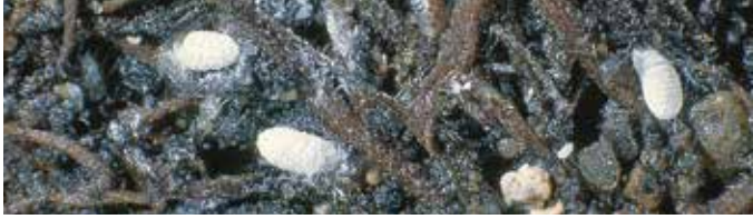
Root mealybugs on outside of root ball

Root mealybugs are in the Genus Rhizoecus . They are sucking pests similar to other mealybugs that feed on stems and leaves, but are adapted to feed on plant roots. Adults resemble small insects that have been rolled in white flour. Adults and their cottony egg masses are usually on the outside of the root ball, and can be seen when the plant is lifted from the container.