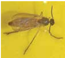
Fungus gnat adult female