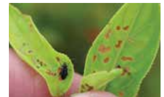
Redheaded flea beetle and feeding damage

There are numerous species of beetles in this family – about 1500 – that feed on plant leaves, including many ornamental plants. Some of the more important members of this group for ornamentals producers include flea beetles, cucumber beetles (also known as corn rootworm adults), elm leaf beetles, viburnum leaf beetles, and cranberry rootworm adults.