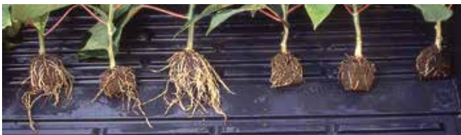
Poinsettias with roots damaged by fungus gnat larvae

Fungus gnat adults are small midge-like flies that cause no direct plant damage. However, the larvae can feed on roots or root hairs, stunting or killing young plants. Fungus gnats have been associated with several plant pathogens. Larval feeding damage may provide an entry point for root pathogens.