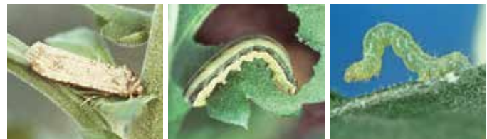
Adult beet armyworm

Order Lepidoptera, Several families such as Noctuidae, Tortricidae, Pyralidae, Arctiidae