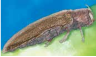
Flatheaded borer adult

Order Coleoptera Families Buprestidae and Cerambycidae