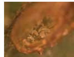
Eriophyid mite, adult(s)

Eriophyids are very small mites, extremely difficult to see with the naked eye requiring a 20X or greater magnification hand lens. Although most Eriophyid mites only cause minor aesthetic damage to plants, some may vector plant diseases including viruses that may severely damage and kill host plants. Symptoms of Eriophyid mite damage include leaf galls, bud or flower galls, blisters and leaf and shoot deformities. Eriophyid mites have been associated with transmission plant pathogens including the rose rosette virus that causes Rose Rosette Disease.