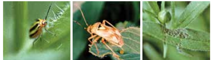
Four-lined plant bug