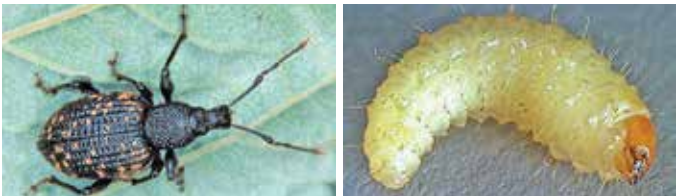
Black vine weevil adult